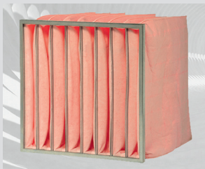
Bag Filter Taschenfilter MultiSack