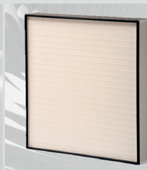
EPA/HEPA Filter Schwebstofffilter Micropur / Macropur